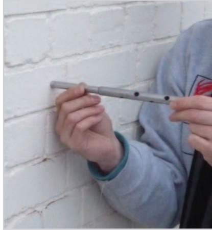
2. Fit the appropriate sized Load Test Key (LTK) at least 50mm (normally one full turn) over the end of the tie. Remove the cross pin, if fitted