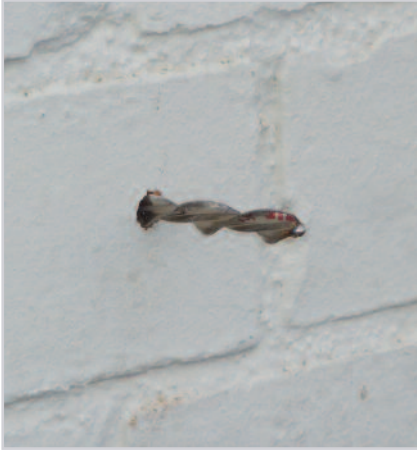
1. Install tie into inner or outer leaf masonry