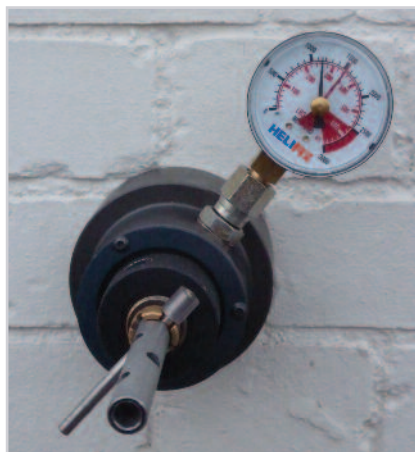
6. Note the reading and then release the tension on the tested wall tie