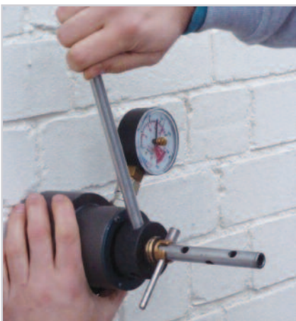
5. Turn the Tommy bar slowly until the proof or maximum load is achieved. DO NOT enter the red zone and DO NOT OVERLOAD