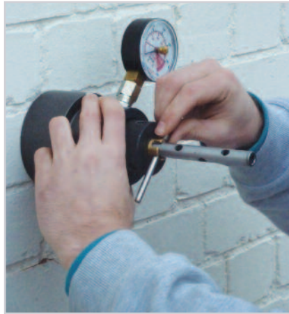
4. Place the cross pin through the LTK and take up the slack on the central nut