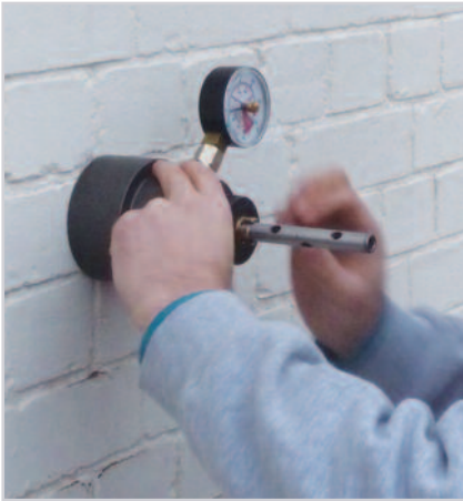
3. Slide the Load Test Unit (LTU) over the LTK and replace the cross pin, engaging it in the castellation on the top of the centre stud